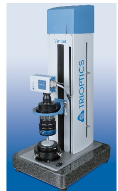
\mu Phase ® VERTICAL