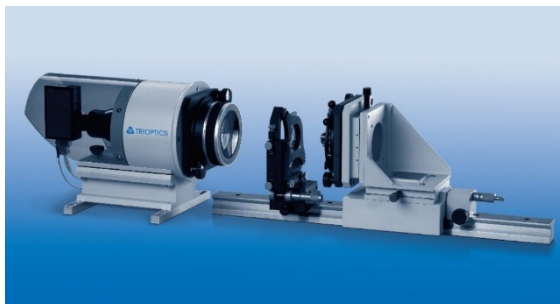
\mu Phase ® UNIVERSAL incl. radius measurement