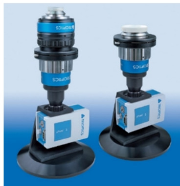
\mu Phase ® SPHERO/PLANO Up