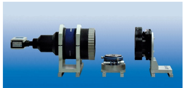
\mu Phase ® UNIVERSAL without radius measurement