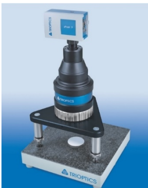
\mu Phase ® PLANO Down