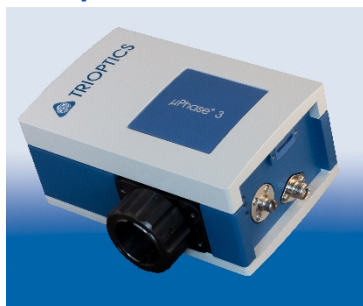
\mu Phase ® base module for customized mounting in various angles